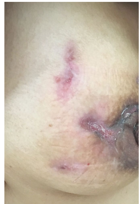
Figure 4. Healed areas of granulomatous mastitis. Significant scarring has resulted.