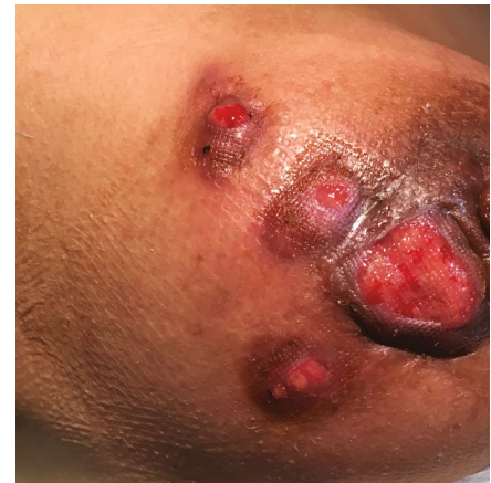
Figure 3. Ulceration and abscess formation typical of granulomatous mastitis