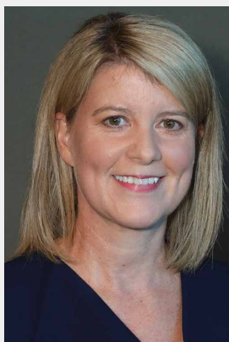
Natasha Stott Despoja